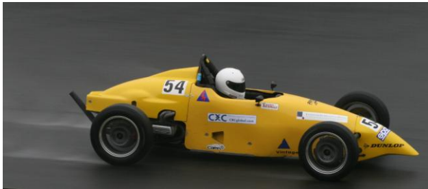
Leigh Porter went fast while being careful