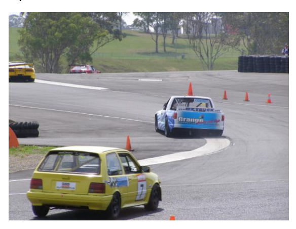
The Supersports avoided the bumpy Turn 4 entry, while the Sports Sedans and HQ's cut the Apex

The North circuit, with its fast Turns 4 and 5, looks like it will allow a high percentage of slipstreaming for Formula Vee, when compared with the regular circuit. However, there are a number of potential characteristics that require refinement. The entry into Turn 4 is quite bumpy, and as a result, a number of categories with longer travel suspension found that completely cutting the Turn 4 apex allowed a competitive advantage.