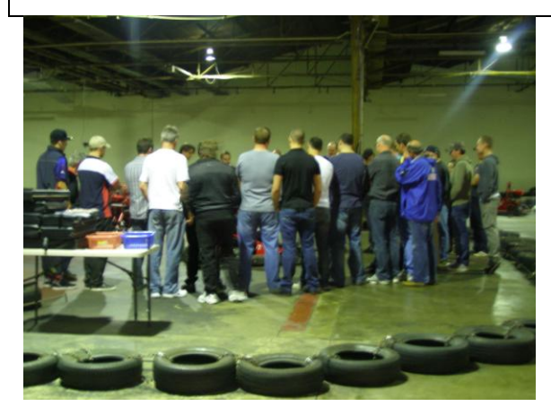
The large Formula Vee contingent gets briefed.