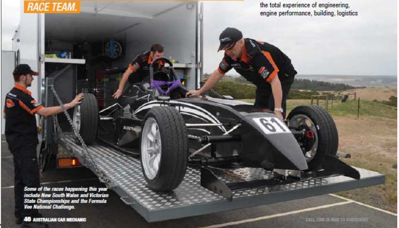
Some of the races happening this year include New South Wales and Victorian State Championships and the Formula Vee National Challenge.

AS PART OF THE PROGRAM, AIM STUDENTS ARE REQUIRED TO PARTICIPATE IN THE INSTITUTE'S REAL RACE TEAM.