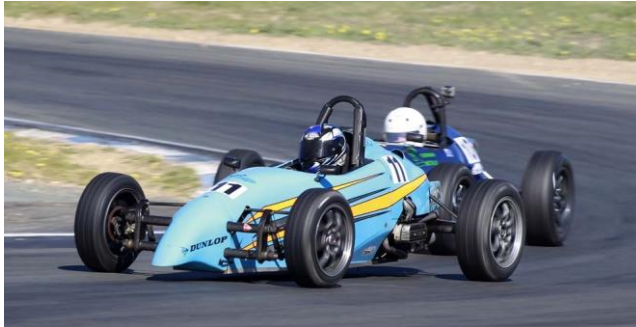
Hookey raced near the front again