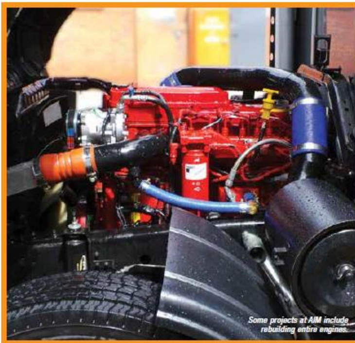
Some projects at AIM include rebuilding entire engines.