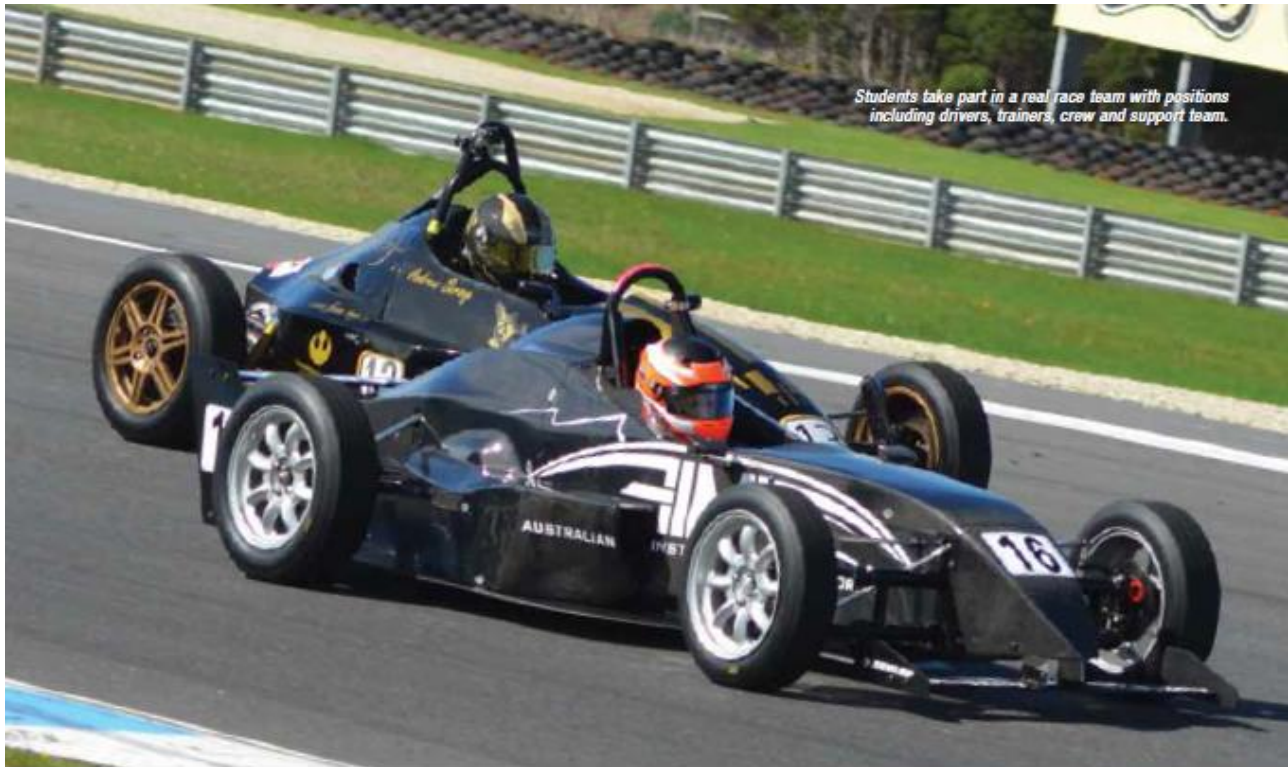
Students take part in a real race team with positions including drivers, trainers, crew and support team.

and motorsport management. The unique training style, a flexible blend of theory and practice, has led to Andy Goodall Training and The Australian Institute of Motorsport becoming a leading player in automotive education, in association with GOTAFE, after only a few short years.